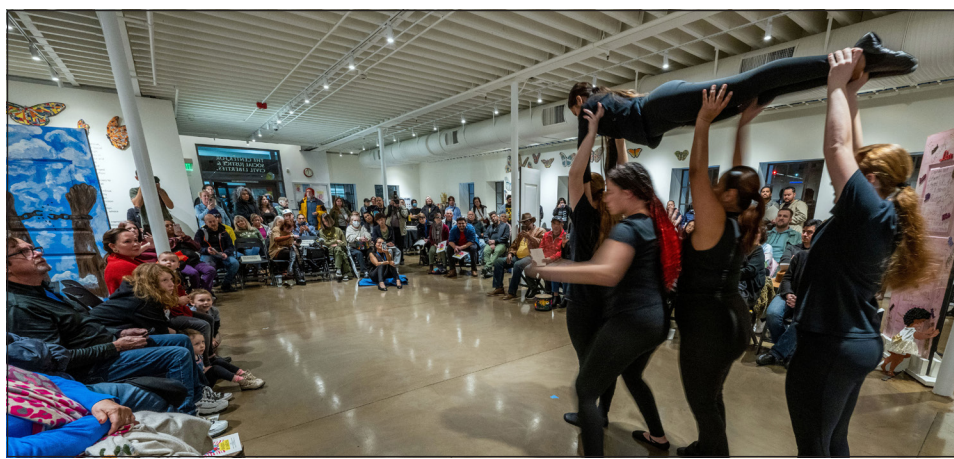
Freedom Dance performs to the Beatles' "Blackbird" at the exhibit at the Center for Social Justice & Civil Liberties in Riverside on Thursday.

The project is a collaboration between the center, the Riverside Community College District, the Arts Magnet Program at Ramona High, Division 9 Gallery and the Inlandia Institute. It's partially funded by the California Arts Council.