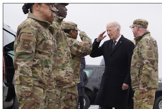
President Joe Biden greets service members after arriving at Dover Air Force Base, Del., on Friday for the arrival of three killed in Jordan.